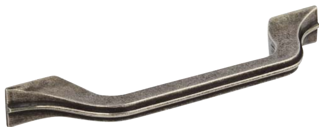
BRUNSWICK pull handle