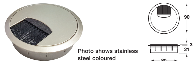
E Cable outlet, brush system, Ø 80 mm