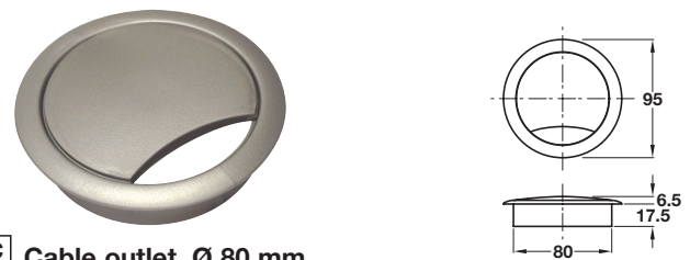
C Cable outlet, Ø 80 mm