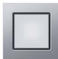
E2 aluminium frame with white LED insert