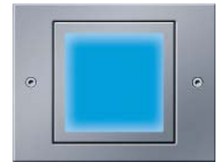
TX-44 aluminium frame with blue LED insert