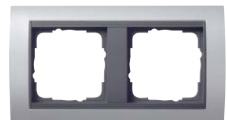
Inserts can be mounted horizontally or vertically in cover frames