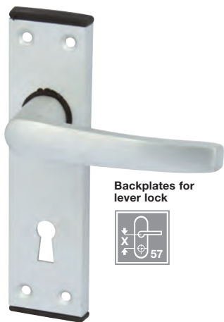
Backplates for lever lock