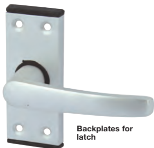
Backplates for latch