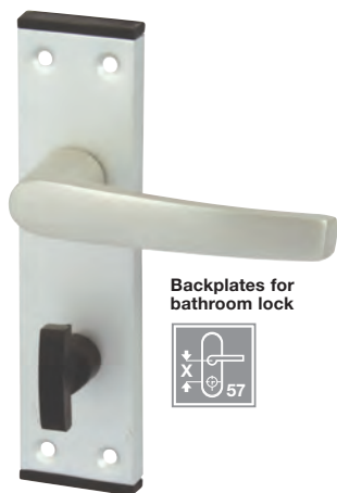
Backplates for bathroom lock