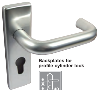
Backplates for profile cylinder lock