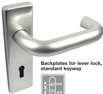
Backplates for lever lock, standard keyway