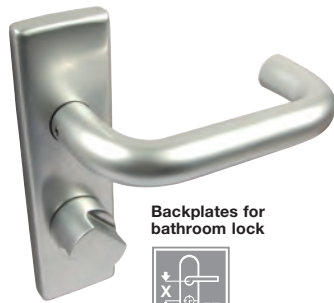
Backplates for bathroom lock