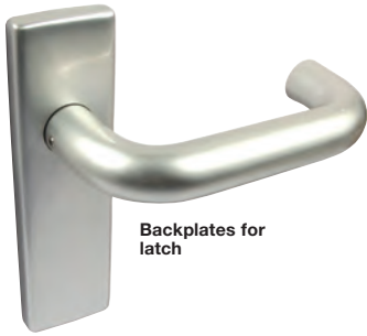
Backplates for latch