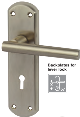
Backplates for lever lock