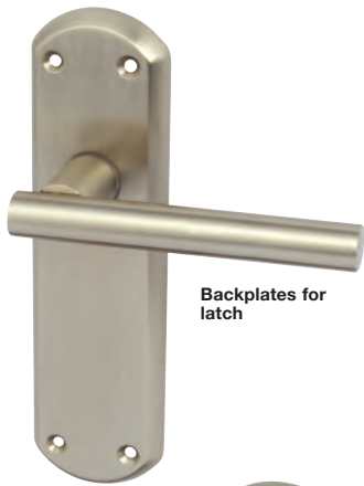
Backplates for latch