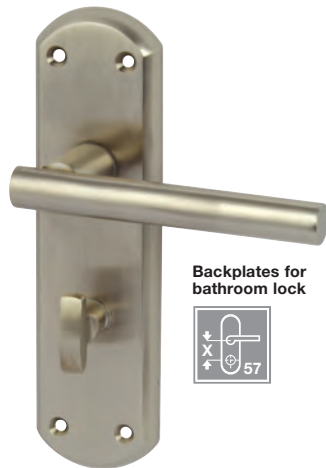
Backplates for bathroom lock