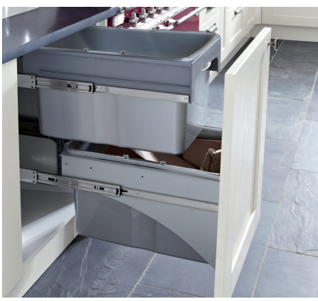
400 mm cabinet - 2 bins