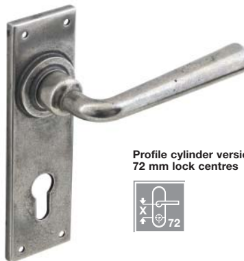
Profile cylinder version 72 mm lock centres