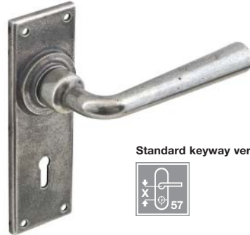
Standard keyway version