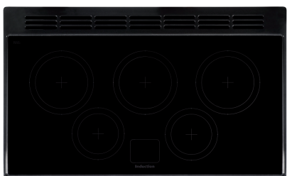
Electric (induction) hob