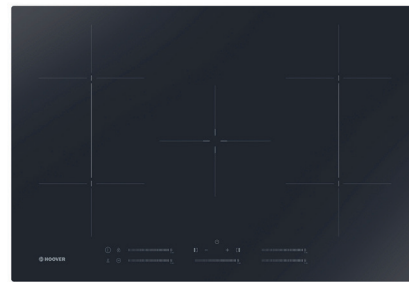
Hoover H700 induction hob, 770 mm